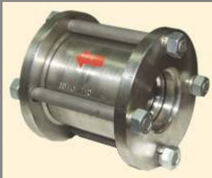
back pressure valves from Dn 80 to Dn 300