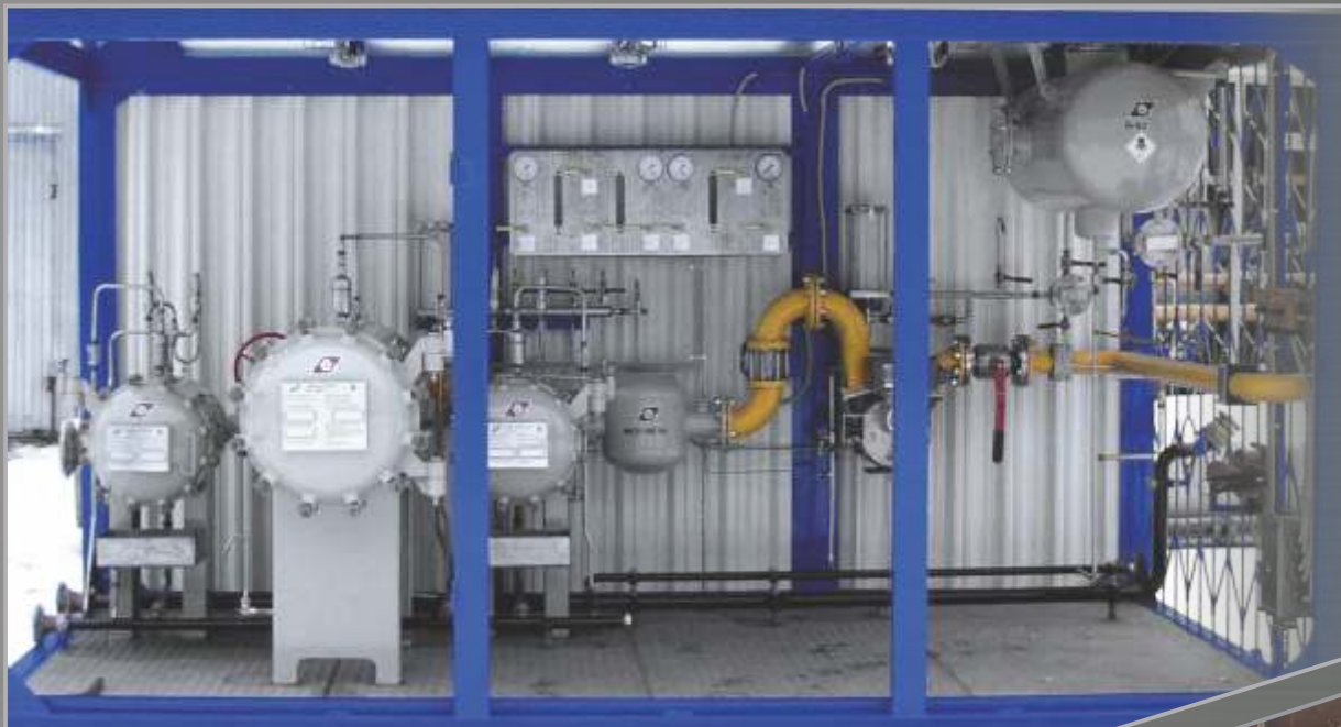
Fuel filtering unit AFT – 120-4-S (AФТ – 120-4-С) Function: loading aviation fuel to refueling trucks with triple filtration, eliminator in the fuel flow, injection of liquids preventing water crystallization and metering. Automatic control system. Container-type 50*50.