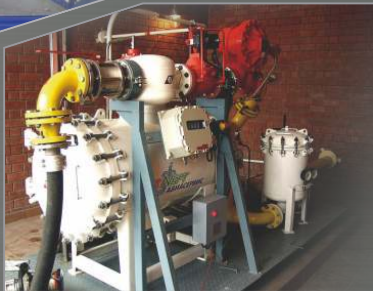
Fuel filtering unit AFT – 160-4-S (AФТ – 160-4-С) Function: loading aviation fuel to refueling trucks with double filtration, eliminator in the fuel flow, injection of liquids preventing water crystallization and metering. Computer control

Komsomolskaya str. 12b, Chekhov, Russia, 142307, www.agregatnpo.ru tel.: +7 496 723 723 5, fax.: +7 496 723 723 7, info@agregatnpo.ru