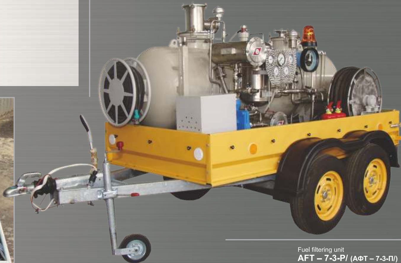
Fuel filtering unit AFT – 7-3-P/ (AФT – 7-3-П/) Mobile dispenser designed for aircraft filling with filtration and dehydration, and metering. Has its own tank. A breathing unit is equipped with an air filter. Automatic control system