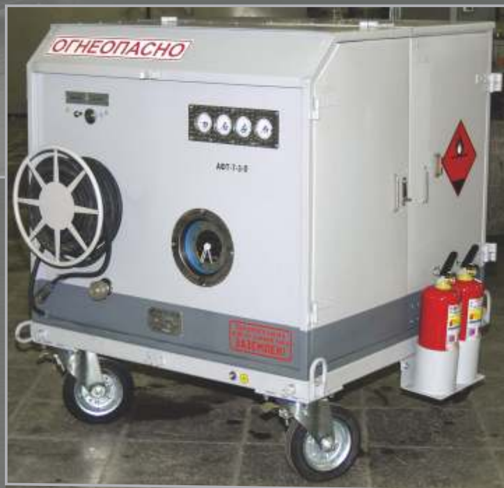
Fuel filtering unit AFT – 7-4-P/ (AФT – 7-4-П/) Mobile dispenser designed for aircraft filling with triple filtration, injection of liquids preventing water crystallization, and metering. Automatic control system.