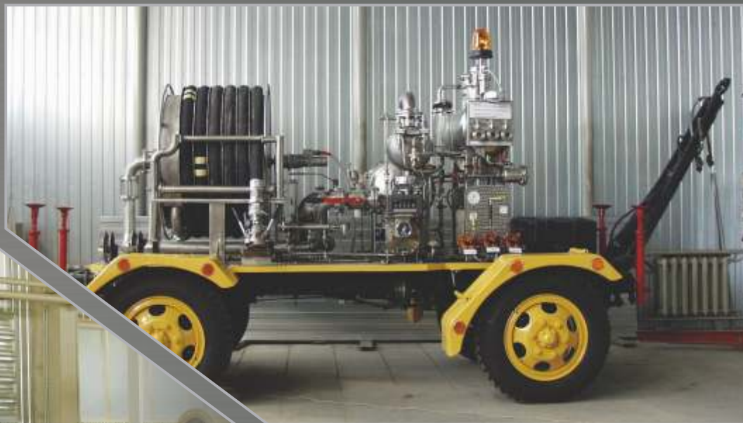
Fuel filtering unit AFT – 60-3-P/ (АФТ – 60-3-Р/) Mobile dispenser designed for aircraft filling with filtration and dehydration, injection of liquids preventing water crystallization, and metering. Automatic control system.