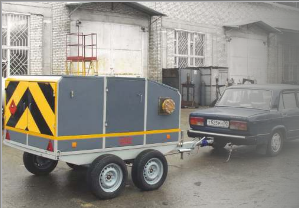
Fuel filtering unit AFT – 30-4-P/ (AФT – 30-4-П/) Mobile dispenser designed for aircraft filling with triple filtration, injection of liquids preventing water crystallization, and metering. Automatic control system.