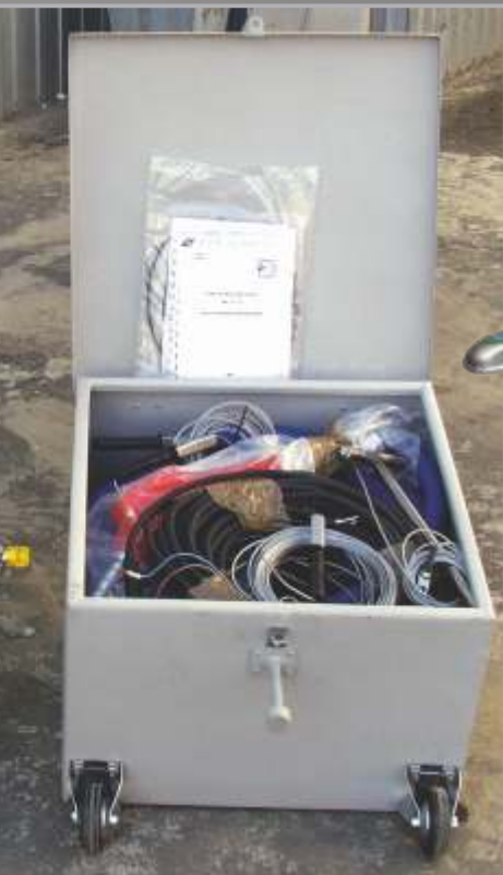
Fuel filtering unit AFT – 3-3-P/ (AФT – 3-3-П/) Mobile dispenser designed for aircraft filling with filtration and dehydration, and metering. Aircraft on-board mains supply