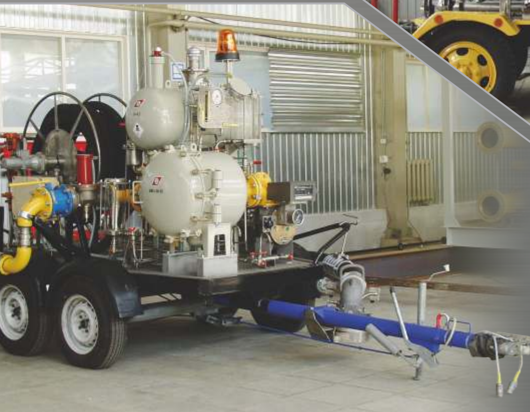
Fuel filtering unit AFT – 30-3-P/ (АФТ – 30-3-Р/) Mobile dispenser designed for aircraft filling from CAFS with filtration and dehydration, injection of liquids preventing water crystallization, and metering. Automatic control system.

Komsomolskaya str. 12b, Chekhov, Russia, 142307, www.agregatnpo.ru tel.: +7 496 723 723 5, fax.: +7 496 723 723 7, info@agregatnpo.ru