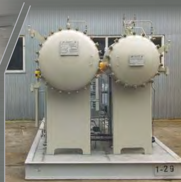
Fuel filtering unit. AFT – 1000-3-S (АФТ – 1000-3-С) A detached modular block consisting of a micro-filter, water separator, and an eliminator in the fuel flow.