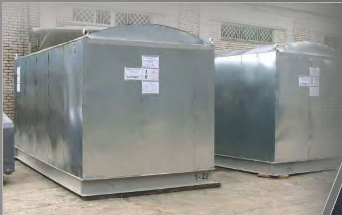
Fuel filtering unit. AFT – 2500-3-S (АФТ – 2500-3-С) Detached modular blocks in transport packaging.