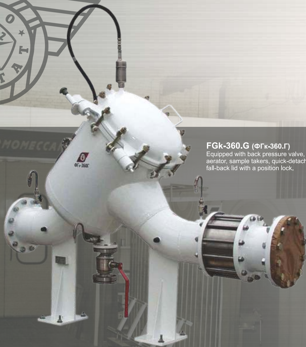
FGk-360.G (ФГк-360.Г) Equipped with back pressure valve, de-aerator, sample takers, quick-detachable fall-back lid with a position lock.